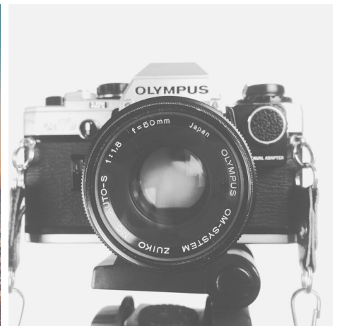
Picture Day September 24