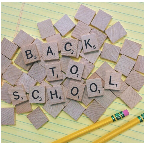
Back to School Night October 24

High school students who have completed the 8th grade or are at least 15 years of age are eligible to take courses at MiraCosta College. Through this program, students can take up to 11 units as part-time Special Admit Students and do not pay registration fees. Other fees may apply (see Important Information for Students and Parents/Guardians on the Mira Costa Concurrent enrollment forms).